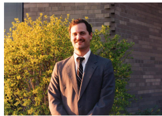
Mayor Blonigan circa 1988.