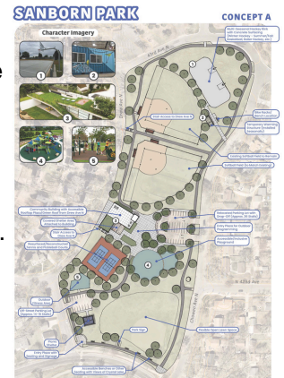
Sanborn Park Concept A

For more information and a closer look at Sanborn Park concept plans, visit www.robbinsdalemn.com/parksmasterplan