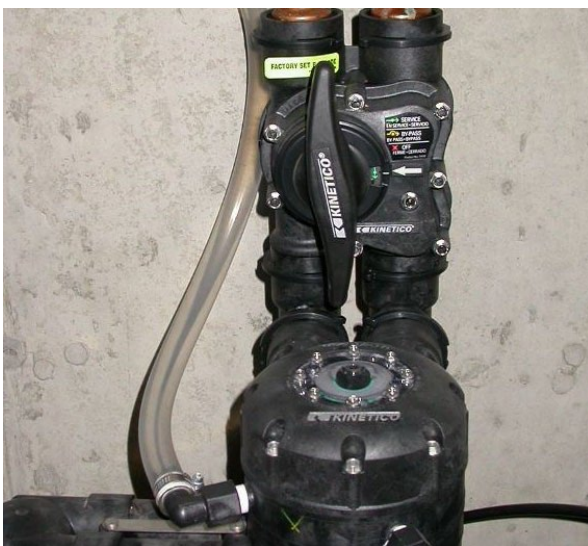
Single Rotating Bypass

Most likely, although no date has been set yet. Our initial focus remains delivering safe and soft drinking water to our customers. An official opening may happen in Spring or Summer of 2023.