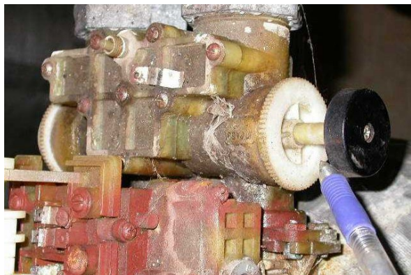
Push / Pull Type Bypass