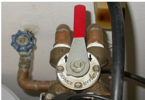
Lever Type Bypass